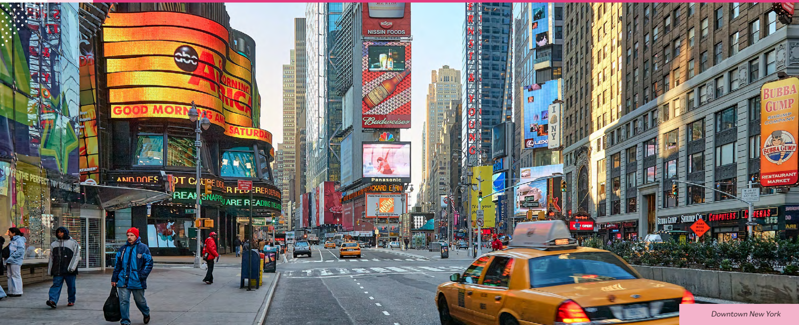
Downtown New York