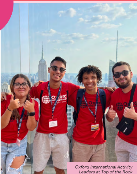
Oxford International Activity Leaders at Top of the Rock

English levels: Elementary - Proficiency (programme can be adjusted to lower English levels).