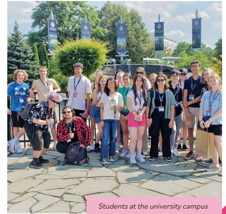
Students at the university campus